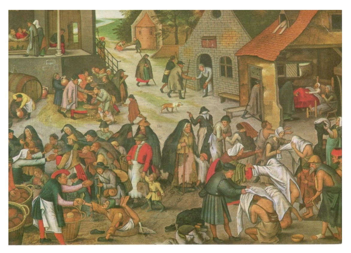
Pieter Brueghel the Younger (Brussels, 1564 – Antwerp, 1638), The works of mercy , around 1630, oil on oak wood, 41.5x56 cm, Lisbon, National Museum of Ancient Art

What strikes about this small painting by the Flemish painter is the lack of a main character.